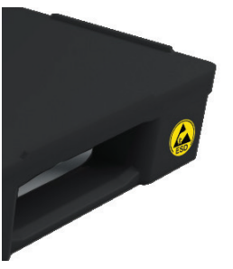
effectively eliminate static electricity.